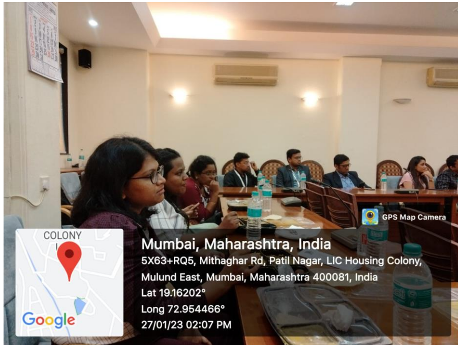
“Management, Staff, Committee Members and Student Volunteers “